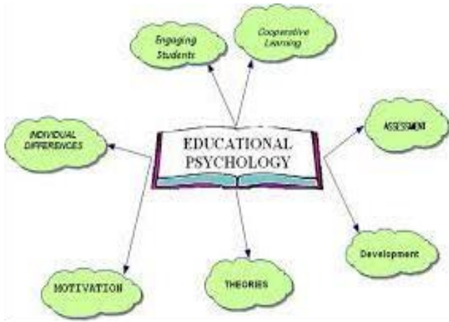
Figure 2: Educational psychology (Source: [3])

Educational psychology supports the scientific study of humans and learning something new. The goals or purpose of educational psychology predicting understanding and controlling the behavior of humans in learning situations. Thereafter the concept of educational psychology is based on how people learn by using several teaching methods, different learning processes, and instructional processes [3]. Therefore, educational psychology impacts the learning of humans as well as it impacts the learning processes that humans adopt to learn. Thus, the impacts of educational psychology on the learning processes of humans are analyzed in this particular research study properly.